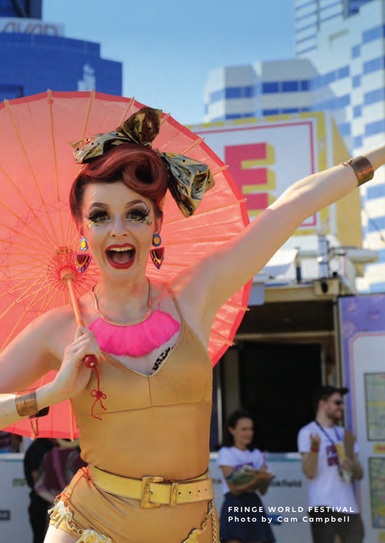
FRINGE WORLD FESTIVAL